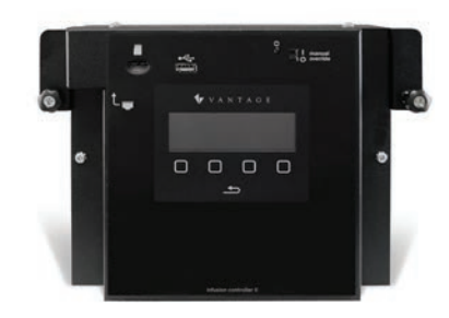
InFusion 36V or 24V

Vantage controllers are among the industry's most powerful options available and function as the central brain of the entire lighting system.