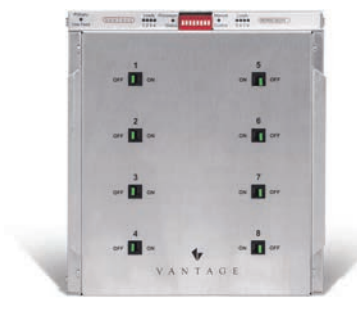
Line Voltage Relay Modules

Vantage's dimming modules are a key component of our industry-leading lighting control solution for luxury residential and commercial spaces. Easily control and dim all of the space's lighting and create flawless lighting scenes.